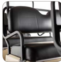
Easy-to-Clean, Durable, Marine-Grade Vinyl Seats