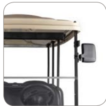
Multiple options available to enhance style and comfort