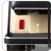
LED Tail Lights and Turn Signals standard