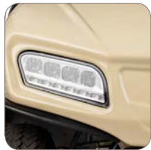
LED Headlights with Daytime Running Lamps standard

The new Villager includes safety-enhancing features such as LED headlights (with daytime running lamps), a four-wheel braking system, turn signals, tail/brake lights, and a horn to ensure that your guests arrive safely.